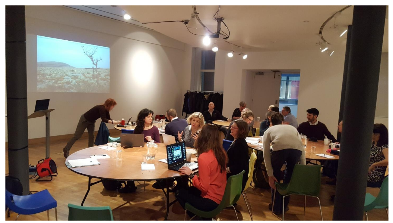
Figure 5. Example of Debrief Meeting in Glasgow, Scotland.