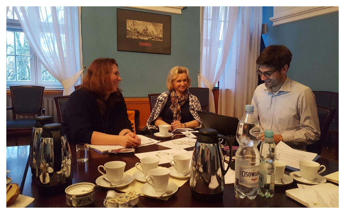
Figure 2. Nature-based solution interviews in the City of Poznań.